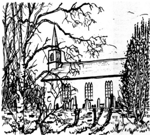
St Hilda's, Westward