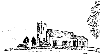
St Mary's, Sebergham