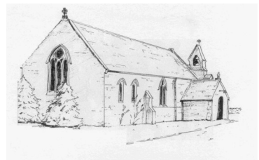
St James', Welton