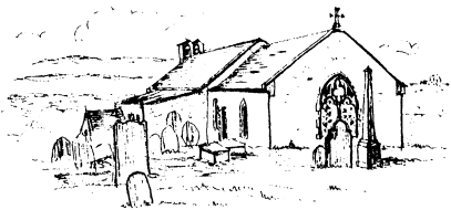
St Kentigern's, Castle Sowerby