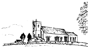
St Mary's, Sebergham