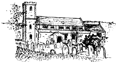
St Kentigern's, Caldbeck