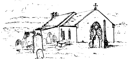
St Kentigern's, Castle Sowerby