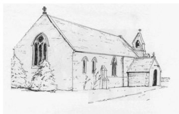
St James', Welton