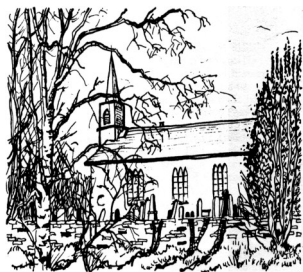
St Hilda's, Westward