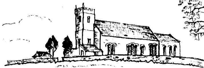
St Mary's Sebergham