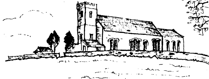
St Mary's Sebergham