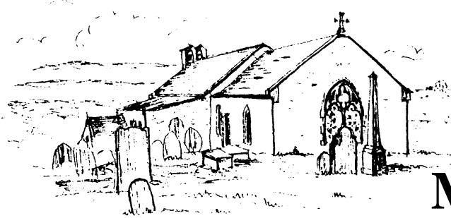
St Kentigern's Castle Sowerby