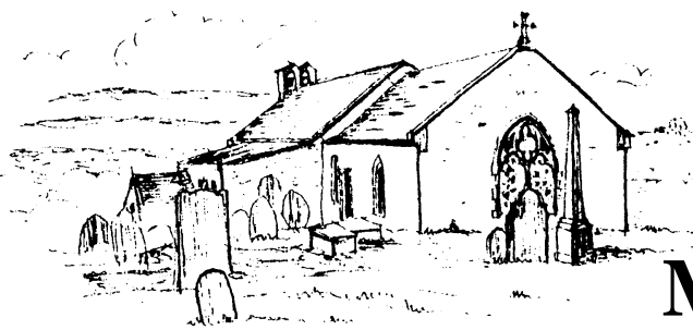
St Kentigern's Castle Sowerby