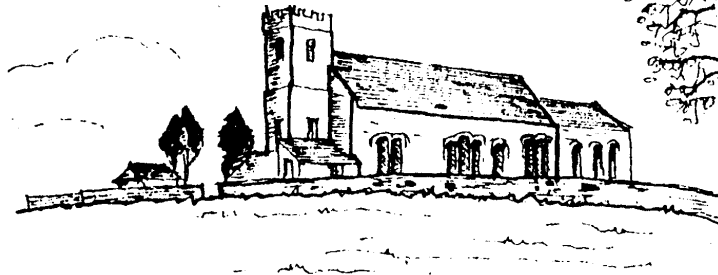
St Mary's Sebergham