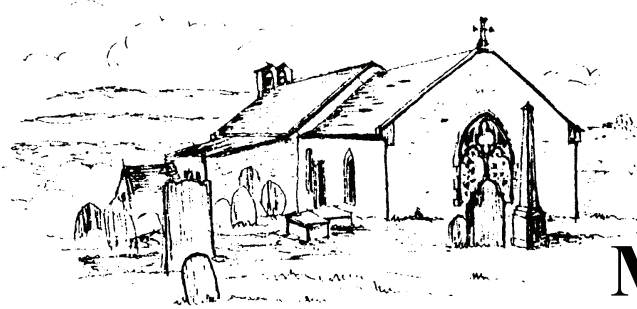
St Kentigern's Castle Sowerby