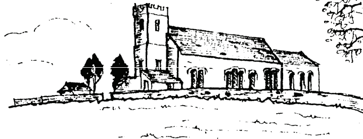
St Mary's Sebergham