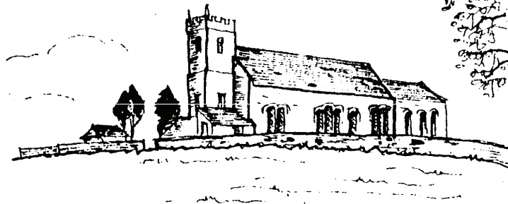
St Mary's Sebergham