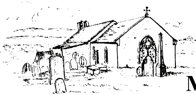
St Kentigern's Castle Sowerby