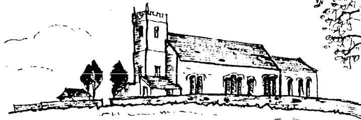
St Mary's Sebergham