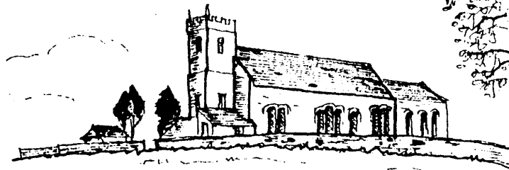
St Mary's Sebergham