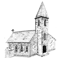
Holy Trinity, Rosley