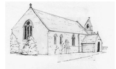
St James', Welton