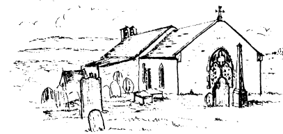
St Kentigern's, Castle Sowerby