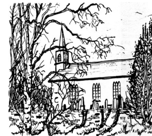
St Hilda's, Westward