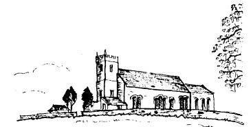
St Mary's, Sebergham