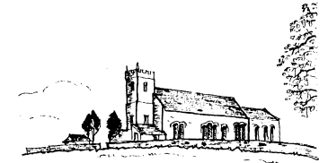
St Mary's, Sebergham