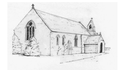
St James', Welton