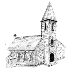
Holy Trinity, Rosley