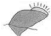
NORTHERN FELLS GROUP

Also open August bank holiday Monday 10am-5pm. Local art and crafts for sale, bric-a-brac in the barn, coffees, teas, light lunches and home baking.