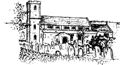
St Kentigern's, Caldbeck